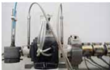
1. Polymer micro-tube extrusion equipment.

To meet the diverse polymer micro-tube properties and dimensions requirements within the Polytubes project and its demonstrator products, there is a necessity to have a flexible equipment set-up, enabling modification of many equipment tooling and production parameters. The Swerea IVF extrusion equipment is shown in Picture 1.