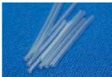
3. Produced COC (Cyclic Olefin Copolymer) polymer micro-tubes

Swerea IVF has made a wide range of experiments, both based on theoretical calculations as well as fine tuning during extrusion. By varying polymer material, melt temperature, melt flow, die dimensions, nitrogen pressure, cooling conditions and draw ratios it is possible to reach a wide range of tube dimensions.