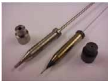
2. Two examples of die set-ups.

To be able to control the inner diameter during the production of micro-tubes, a nitrogen gas pressure device is designed to optionally be attached onto the inner die tip metal tube and controlled by small pressure valves.